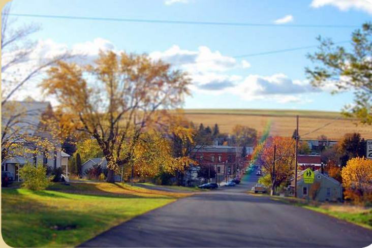
SERA Architects and Cogan Owens Cogan, LLC supported by Oregon TGM Program

Despite these challenges, Weston also has many assets, both within city boundaries and not far beyond the backdoor. Historic buildings on Main Street, a rich pioneer history, and the city's friendly atmosphere all contribute to an idyllic