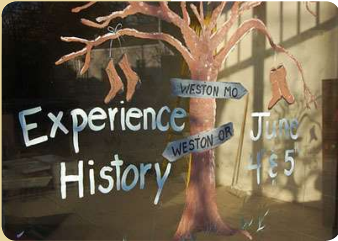
SERA Architects and Cogan Owens Cogan, LLC supported by Oregon TGM Program