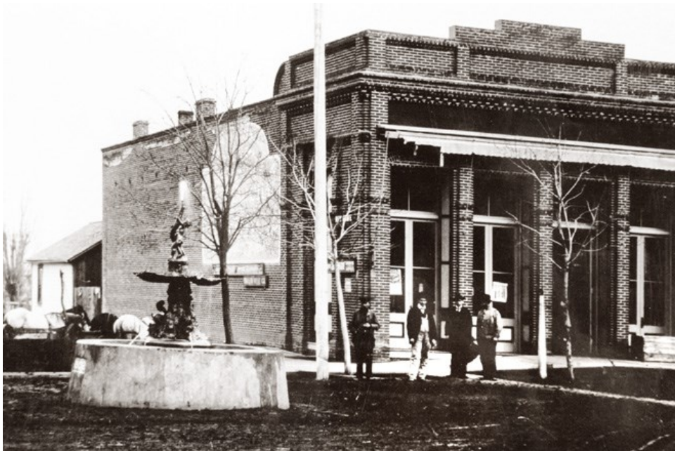
Left: Saling & Reese building circa 1910 with fountain in the center of the intersection. The fountain is now in a mini park at the foot of Main Street to the West.