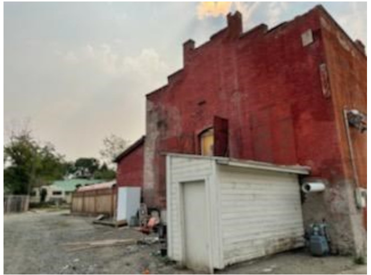
Right: North Wall of building