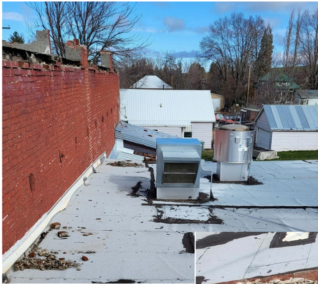
Left: East Wall where roof connects.