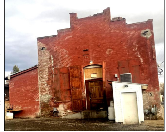
in the back are to be repaired. Shutters at the back door

tions: replacing missing bricks, and filling in the openings where air condition units had been installed on the West wall. Steel shutters in the back are to be repaired.