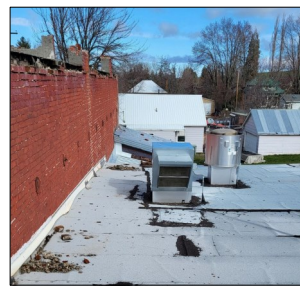
East Wall and Roof over

After a devastating fire in September 2021 closed the restaurant for a year, the Long Branch Café and Saloon still has a long way to being completely restored. The building was under restoration when the fire hit. Repairs were not completely covered by insurance