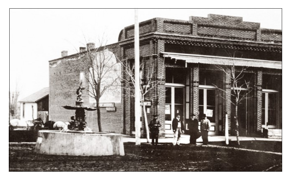
W-110-21 - Saling & Reese Store. Note mural on wall.

The building is rectangular in plan with an approximate frontage of 40 feet on Main Street. The facade is organized into four bays in which openings are recessed in deep reveals and were, historically, protected by iron shutters. The window treatment in these exceptionally tall reveals has been modified considerably, but the brick piers dividing the bays are intact.