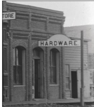
1886 Geo. W. Proebstel Hardware opens. Closes in 1890.