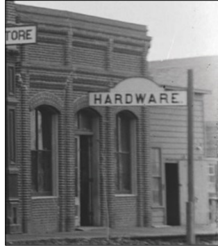
1886 Geo. W. Proebstel Hardware opens. Closes in 1890.