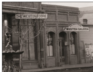
Weston Saloon opens in